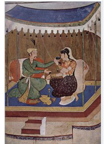
17th-century Mughal painting