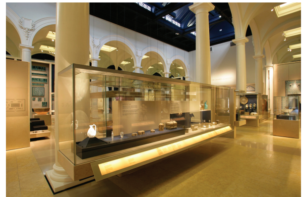
Victoria & Albert, Room 42, The Jameel Gallery. www.vam.ac.uk