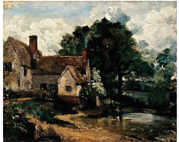
John Constable. Willy Lott's House.

Hanif Saeed (HAWN-IF SIE-EED) - Fictional character.